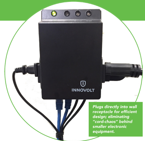
Plugs directly into wall receptacle for efficient design; eliminating "cord-chaos" behind smaller electronic equipment.

Innovolt's CoreProtect solution offers protection for all power anomalies that are known to cause equipment errors, failures and downtime. Beyond surge or filter solutions, CoreProtect remediates the impact of all damaging power disturbances before vital equipment can be harmed. This solution focuses on value while delivering maximum protection for any electronic equipment.